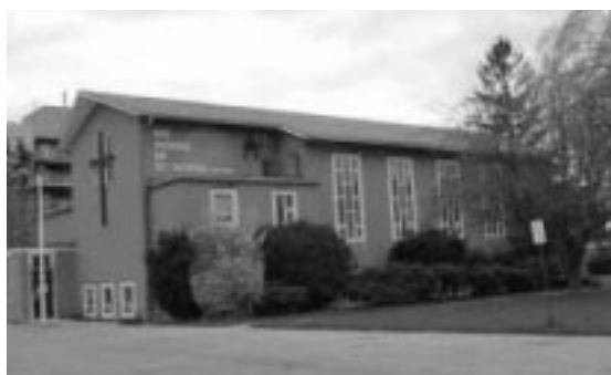
Scarborough Group 3756 St. Clair Ave East (Just East of Brimley)

The Chairman chaired; the readers read (most everything that was ever printed); the speaker spoke; and my attention span was next to nil. Given the start of my own agony, I thought that the meeting would never end!! Being drunk and trying to act sober is very hard work...and something, because of A.A., I have never had to do since. The formal meeting was then over and I was now on the recovery end of A.A.'s most glowing-